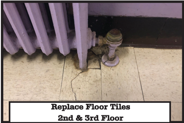
Replace Floor Tiles 2nd & 3rd Floor