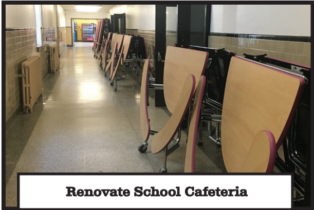
Renovate School Cafeteria