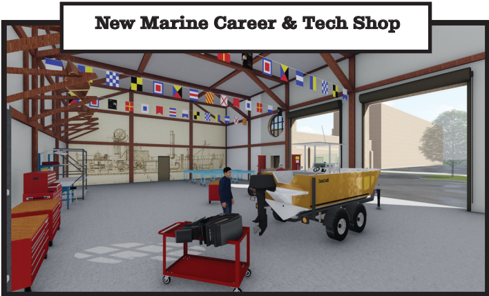
New Marine Career & Tech Shop