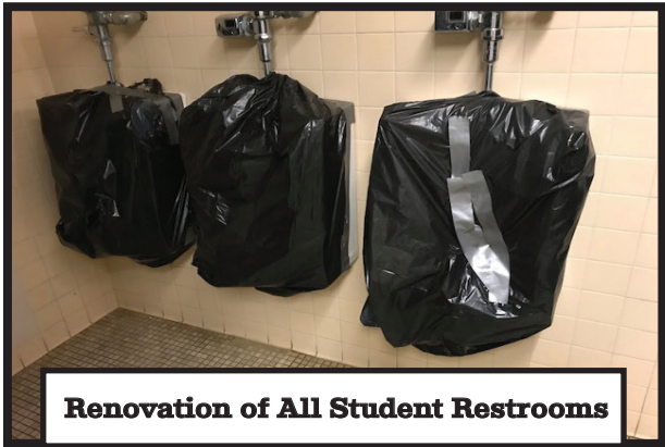
Renovation of All Student Restrooms