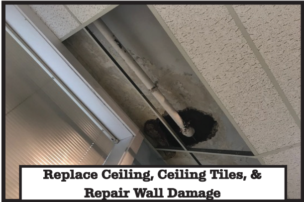
Replace Ceiling, Ceiling Tiles, & Repair Wall Damage